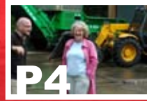
P4 Climate Change