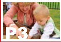
P3 New Play Areas